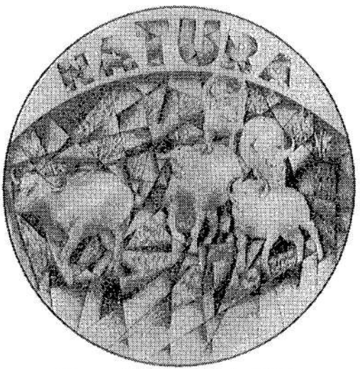
Natura 1997: 1/2 OZ Au 999.9