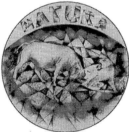
Natura 1997: 1 OZ Au 999.9