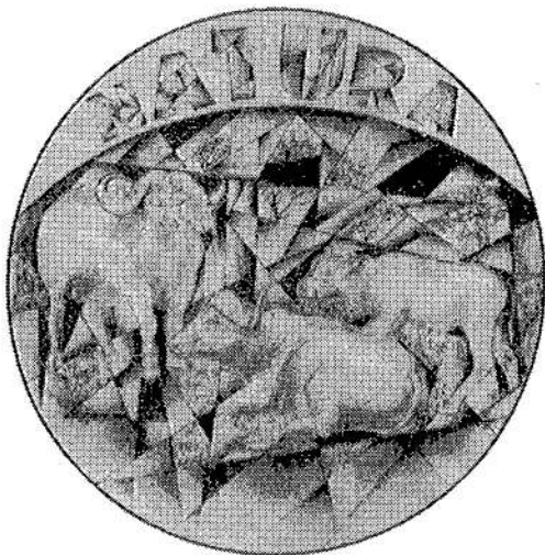
Natura 1997: 1/4 OZ Au 999.9