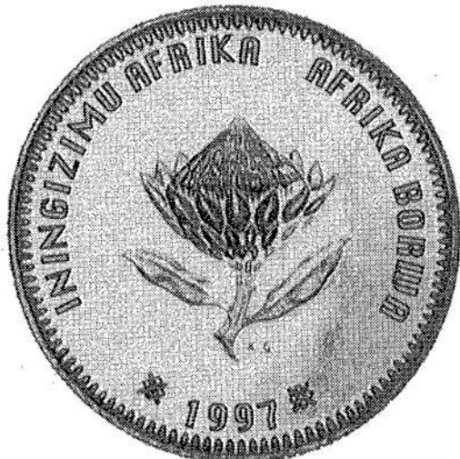
Obverse: 2 1/2 c