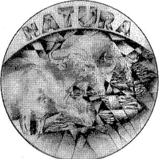
Natura 1997: 1/10 OZ Au 999.9