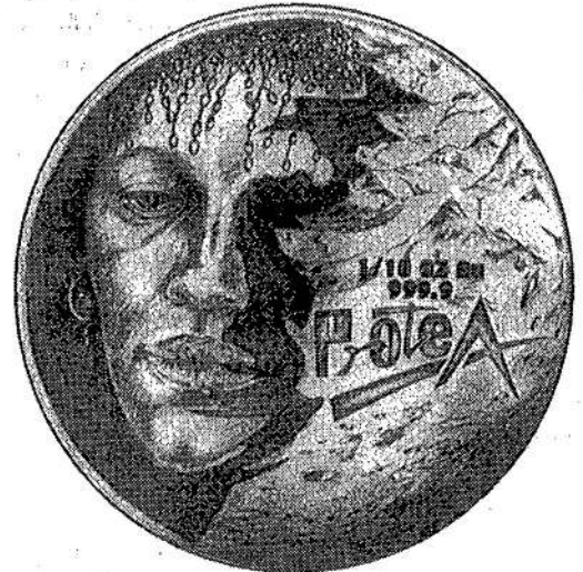
Protea 1997: 1/10 OZ Au 999.9