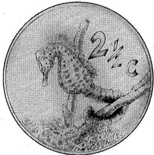
Reverse: 2 1/2 c