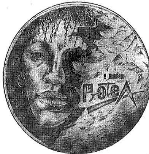
Protea 1997: R1 Silver