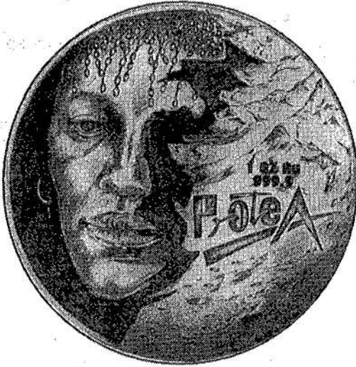
Protea 1997: 1 OZ Au 999.9