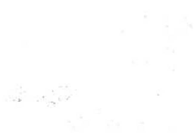
Figure 1: Scatter plot showing a positive linear correlation between two variables.