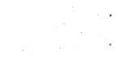
Figure 2: Scatter plot showing a negative linear correlation between two variables.