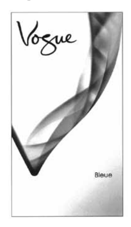
FILED: 27 November 2007

Address for service: SPOOR & FISHER, c/o H.D. BOSSAU & Ca, 15th Floor, Frans Indongo Gardens, Dr Frans Indongo Street, Windhoek, Republic of Namibia.