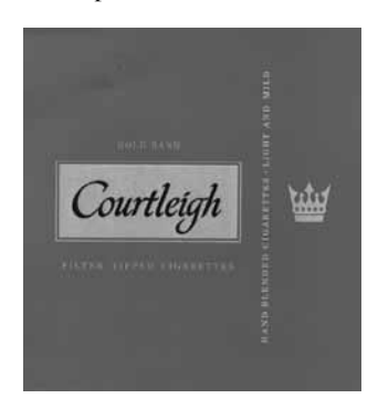
FILED: 26 September 2007